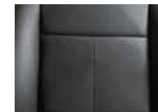
Ti/TL leather seat trim