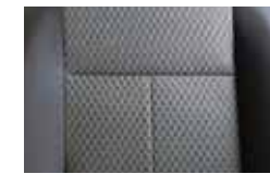
ST/ST-L/TS cloth seat trim