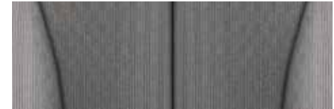
Charcoal ST cloth trim.

Finance and Insurance solutions designed for your Nissan. Designed for you.