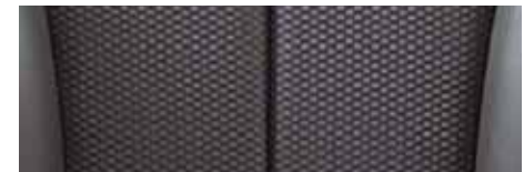
Charcoal Q & Ti premium trim.

Minor trim variations may occur from time to time.