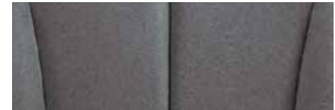
Charcoal ST-L tricot cloth trim.