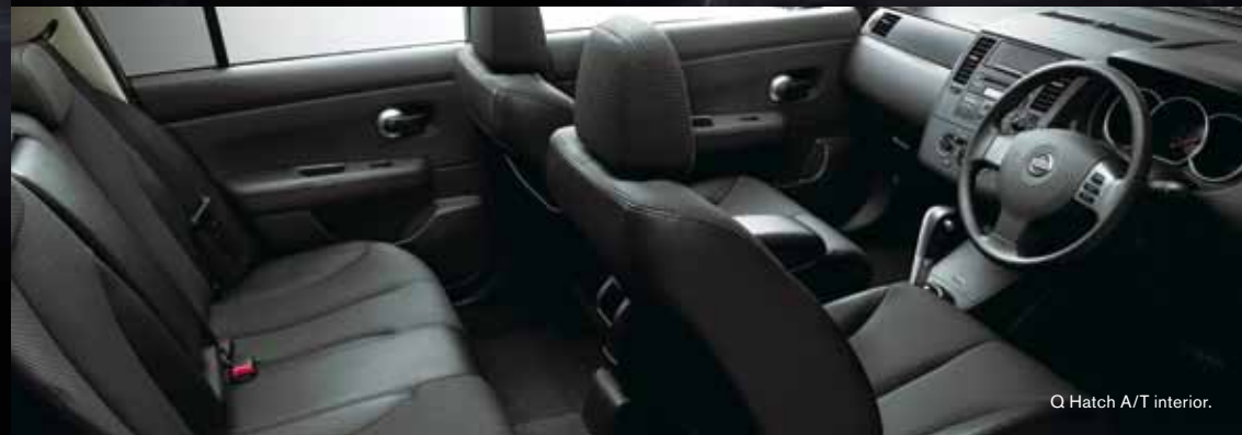
Q Hatch A/T interior.