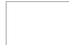
Arctic White (326)

Minor trim variations may occur from time to time.