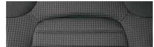
Charcoal cloth ST.

All illustrations, information and specifications presented and referred to in this brochure were correct at the time when this brochure was approved for printing. The colours in the photographs may vary from actual colours. However, Nissan Motor Co (Australia) Pty. Ltd. reserves the right, subject to the laws of Australia and/or the regulations of any competent authority which may apply from time to time, at its discretion at any time and without prior notice to discontinue or change the models, features, specifications, designs and prices of the products referred to in this brochure and any optional equipment therefore without incurring any liability whatsoever to any purchaser or prospective purchaser of any such products. Some of the items referred to herein are optional at extra cost. Some options may be required in combination with other options. Always consult your Nissan Dealer for the latest information on models, specifications, features, prices, options and availability. Nissan Motor Company (Australia) Pty. Ltd. ACN 004 663 156. Printed May 2009. 2008MY. PTH0283.