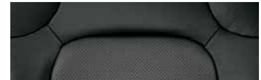
Charcoal leather Ti.

Minor trim variations may occur from time to time.